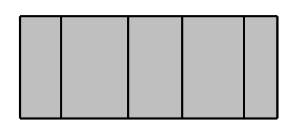
(d) 130,000 (e) None of the above

[10]. Find the point (x_0, y_0) in the first quadrant that lies on the hyperbola y^2 - x^2 = 5 and is closest to the point A(4, 0). Then (x_0, y_0) is